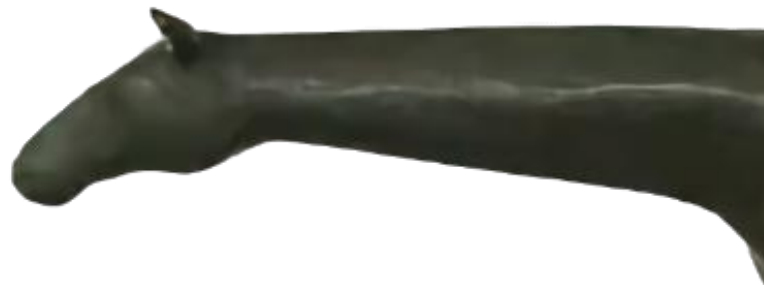
Horse 1988 bronze edition 4 of 6 103 x 54 x 32 cm